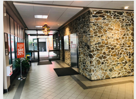
1175 Cook Street Lobby.